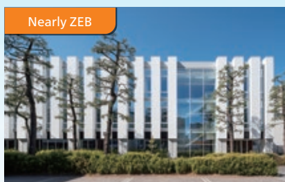
EXEO Group, Inc. South Kanto Branch