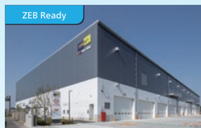
Landport Fukuoka Hisayama I