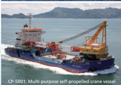
CP-5001: Multi-purpose self-propelled crane vessel