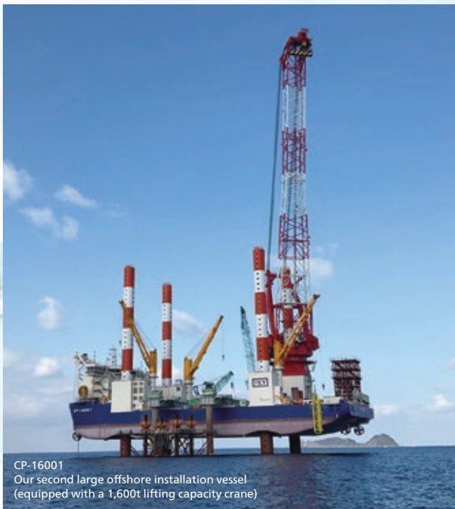
CP-16001 Our second large offshore installation vessel (equipped with a 1,600t lifting capacity crane)

Project outline