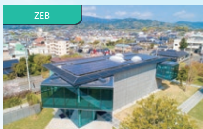
Hisamitsu Pharmaceutical Museum

(Based on materials compiled by the ZEB Roadmap Follow-up Committee in FY 3/19)