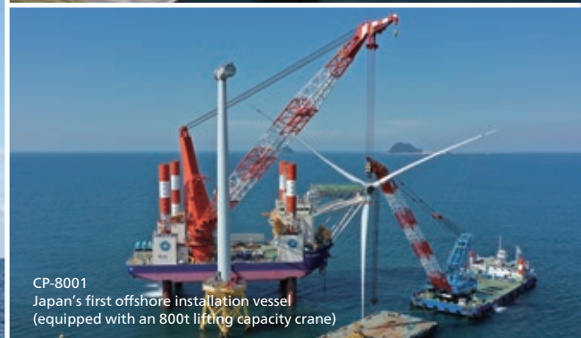
CP-8001 Japan's first offshore installation vessel (equipped with an 800t lifting capacity crane)