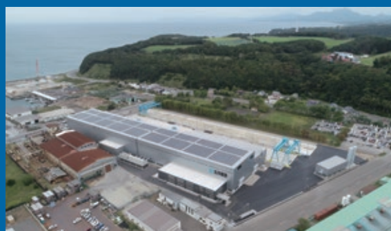
New Muroran Factory

By-product hydrogen: Hydrogen produced as a by-product at a plant in Hokkaido is stored in hydrogen tanks, and used in fuel cells to generate electricity.