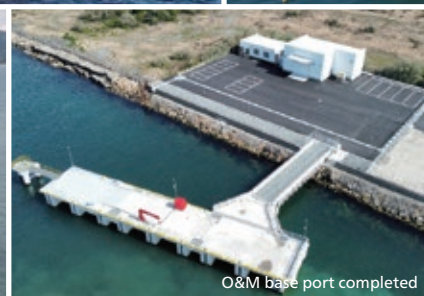
O&M base port completed