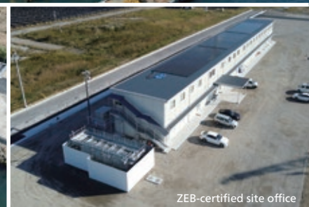
ZEB-certified site office