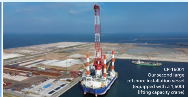
CP-16001 Our second large offshore installation vessel (equipped with a 1,600t lifting capacity crane)