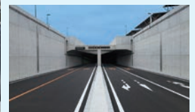
Completion of the Tokyo Port Umi no Mori Tunnel (2020)

under adverse conditions has been handed down in our corporate DNA as our "enterprising spirit." (dredger operation), and Jin Industrial Co., Ltd. in 1970 (extending our business to Hokkaido)