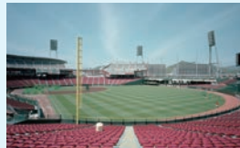
Completion of MAZDA Zoom-Zoom Stadium Hiroshima (2009)