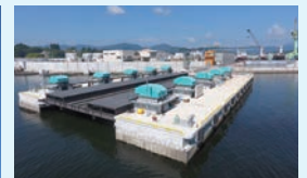
Completion of the ship Mirai (2019)