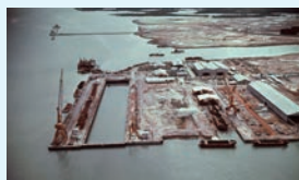
Undertook the construction of the pier at the Jurong Shipyard docks Foray into Singapore (1964)