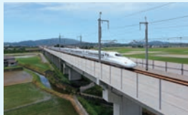
Completion of the Kyushu Shinkansen Tamanatsuru Bridge (2008)