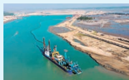
Completion of a self-propelled cutter suction dredger, "CASSIOPEIA V" (2014)