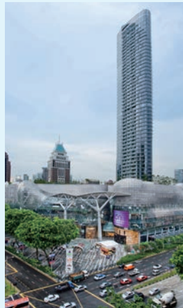
Completion of ION Orchard, and the Orchard Residence in Singapore (2010)