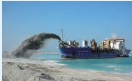
Self-propelling trailing suction hopper dredger, "QUEEN OF PENTA-OCEAN," (currently ANDROMEDA V) put into commission in Singapore (1999)

2014 to 2022 Emerging as a genuine global general contractor with strengths in port, coastal, waterfront areas, and overseas