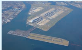
Opening of D-Runway of Tokyo International Airport (2010)