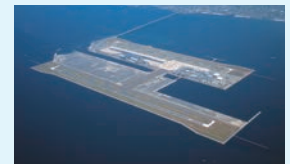
Contract awarded for phase I and phase II of construction of artificial island for Kansai International Airport (1986, 1999)