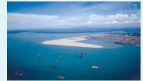
Contract awarded for Tuas Reclamation in Singapore (1984)