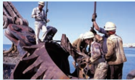
Contract awarded for Suez Canal expansion (1961) Contract awarded for Suez Canal Widening and Deepening (1974)