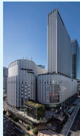
Completion of Yodobashi Umeda Tower (2019)