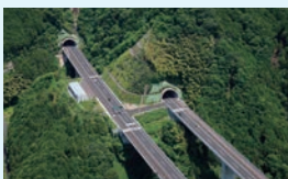
Completion of Kogouchi Tunnel of New Tomei Expressway (2005)