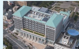
Completion of Kure City Hall (2015)