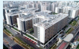
Completion of Sengkang Integrated Hospital in Singapore (2018)