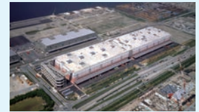
Completion of the World Cargo Distribution Center (1993)