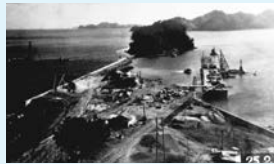
Contract awarded for construction of first large-scale quay walls and industrial facilities in the postwar era in Tsukumi Port, Oita Prefecture (1948)