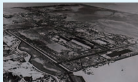
Contract awarded for construction of coastal industrial zone for NKK Corporation (currently JFE Engineering) in Fukuyama City (1961)