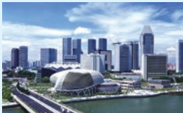
Completion of Esplanade-Theatres on the Bay in Singapore (2002)