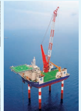
Completion of a multipurpose self-elevating platform, "CP-8001" (2018)