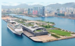
Completion of the Kai Tak Cruise Terminal (2013)