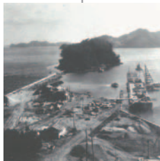
Contract awarded for construction of first large-scale quay walls and industrial facilities in the postwar era in Tsukumi Port, Oita Prefecture (1948)