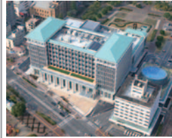
Completion of Kure City Hall (2015)