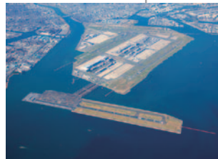
Opening of D-Runway of Tokyo International Airport (2010)