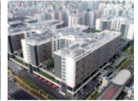
Completion of Sengkang Integrated Hospital in Singapore (2018)