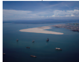
Contract awarded for Tuas Reclamation in Singapore (1984)