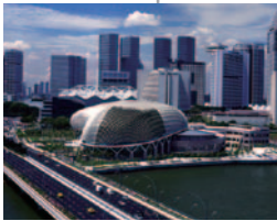
Completion of Esplanade-Theatres on the Bay in Singapore (2002)