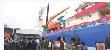
Self-propelled cutter suction dredger, CASSIOPEIA V was built