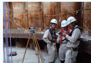
Welcoming students at sites in Japan and Asia