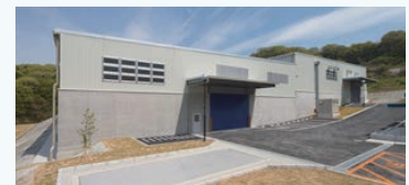
"Miki Biotech Co., Ltd." → a subsidiary company built a composting plant and began operating