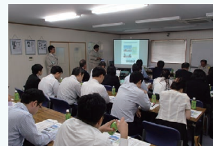
Holding an Investors and Analysts Tour