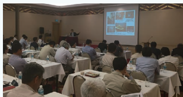
A crisis-management workshop titled "Precaution against collateral damage by acts of terrorism against Japanese" was held for employees who are working overseas or planning to travel overseas on business