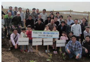
Tree-planting event on a landfill in the port of Tokyo

observation-tours of sites and the technical research center. Through these activities, we aim to be a well trusted group of companies invoking the continuous support of our stakeholders.