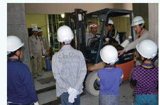
Family day for site visit