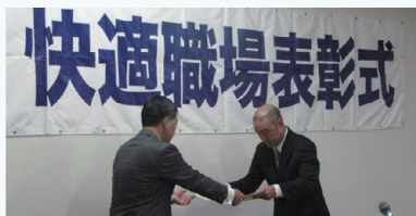
Award of the comfortable workplace special award for "Kashima Port Rehabilitation Project" by the Japan Federation of Construction Contractors

We also uphold eco-friendly construction promoting environmentally-conscious manufacturing as a high priority.