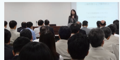
Holding the "Human Rights Awareness Top Management workshop"