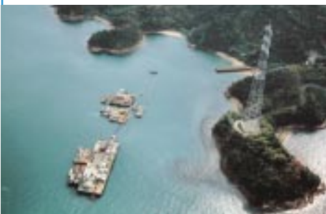
Aki-Nada submarine pipe-embedding work site, Hiroshima

The Aki-nada No. 6 submarine pipe-embedding project in Hiroshima Prefecture has increased the supply of city water to 30,000 island residents. Penta-Ocean's super-large submarine pipe-embedding vessel, the Tekkai was used to complete the work. Submarine pipes, 400 mm in diameter, were connected one after another to span approximately 3.5 kilometers, at the maximum sea depth of about 60 meters. The Group's expertise in marine construction and advanced technology made it possible to complete the large-scale project.