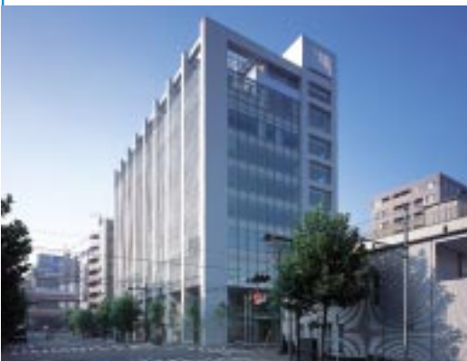
Nihonbashi Yasuda Sky Gate, Tokyo

The construction work the Group has accepted from an urban redevelopment association in the Nihonbashi Hamacho area, includes the construction of a 10-storied composite building, the Nihonbashi Yasuda Sky Gate , an intelligent building that will offer comfortable office environments suitable for the era of advanced information in the 21st century.