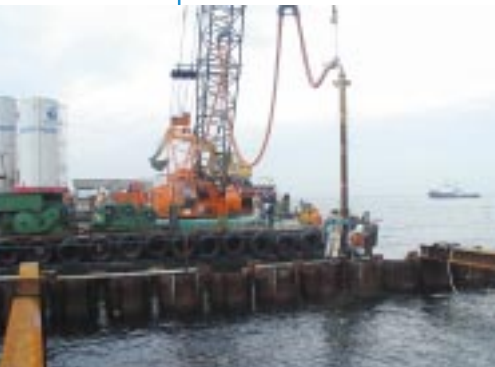
Clay Guard method work site

This method was designed to improve extremely soft ground. An airtight cap and a water-discharging hose are coupled to a drainage system and then directly connected to a vacuum pump. This process gives load to the drainage and improves the soil. Not requiring conventional sealing sheets or sand mats, the new method is both cost and time efficient, and since it does not use any solidifying agents, it is friendly to the environment.