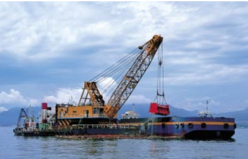
END method work site