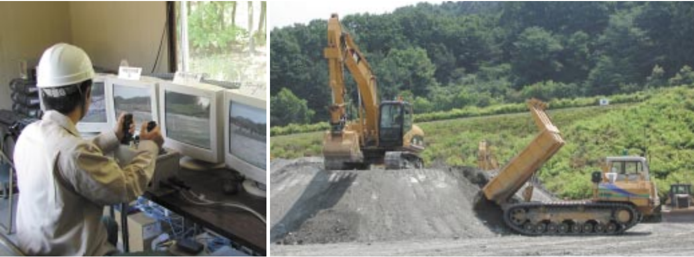
Remote control earthmoving system and control room