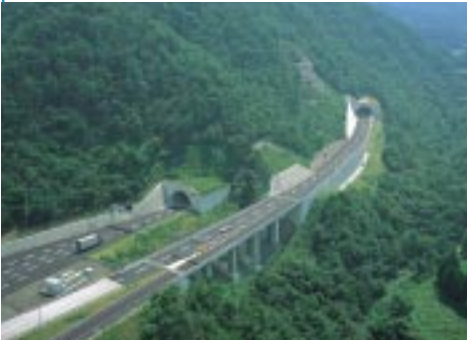
Hanshin Highway, Kita-Kobe route, Hyogo

Under these circumstances, consolidated net sales of domestic civil engineering and construction amounted to ¥326,217 million (US$2,713 million), a decrease of 10.0% from the previous term.