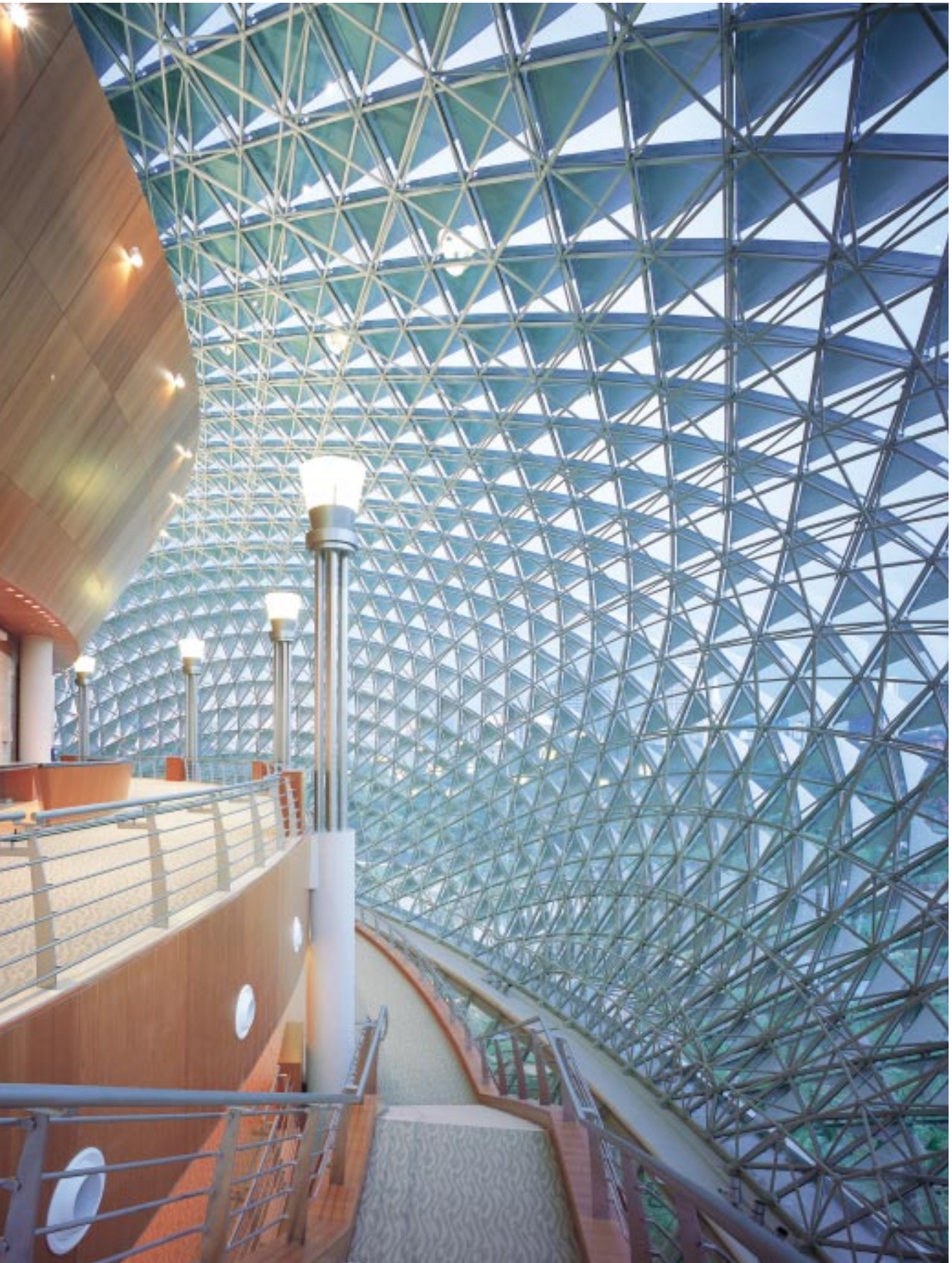
The Grand Foyer of Esplanade-Theatres on the Bay, Singapore