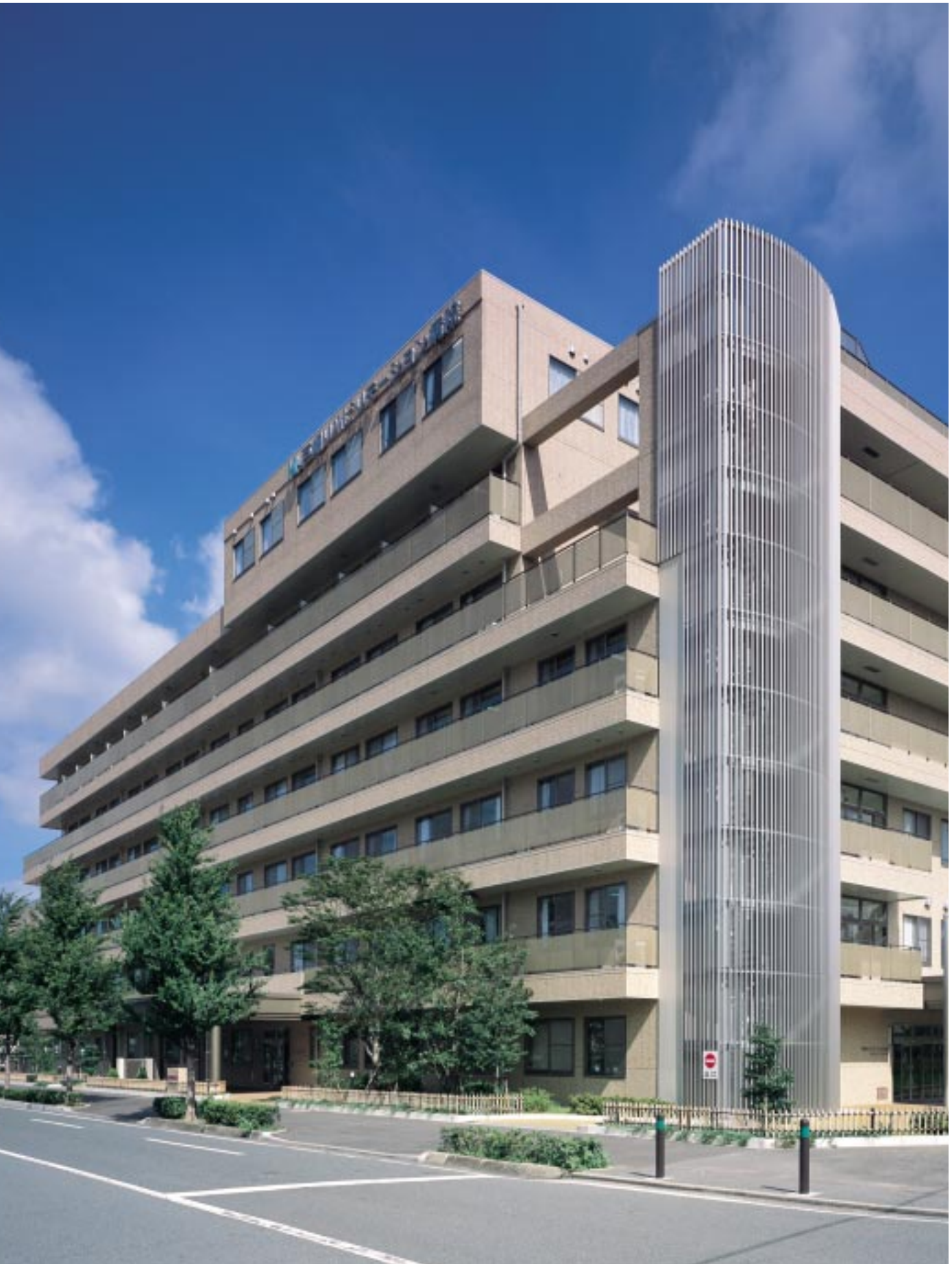
Tobata Rehabilitation Hospital, Fukuoka