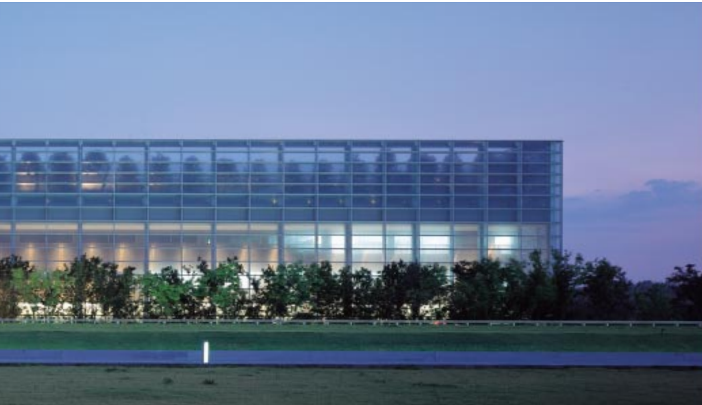
The Kansai-kan of the National Diet Library, Kyoto