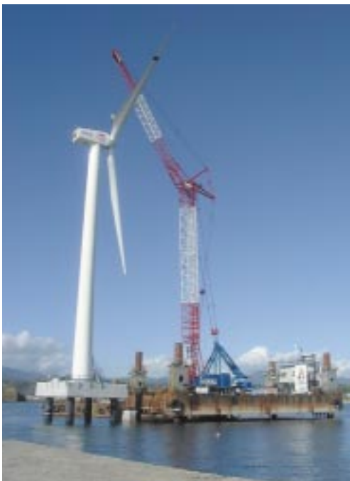
Setting up wind generation electricity plant at Setana coast, Hokkaido

Off the coast of Setana, Hokkaido, another wind power station is currently under construction. Scheduled for completion during the current term, the Setana plant will be Japan's first floating wind power station. The project is part of a larger project underway to build multipurpose wharfs to protect coastal areas in that region. The wharf foundation, constructed by Penta-Ocean, has been specially designed to provide a habitat for native marine life.