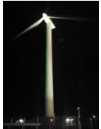
Tokyo Coastal Wind Plant, Tokyo

The Tokyo Coastal Wind Plant, completed in March 2003, is located in Koto Ward, Tokyo and is the first wind generation project located in the Tokyo metropolitan area. The Tokyo Municipal Government carried out the project and Jay Wind Co., Ltd. Penta-Ocean constructed the foundations for the facility, which is capable of generating enough electric power to sustain 800 households.