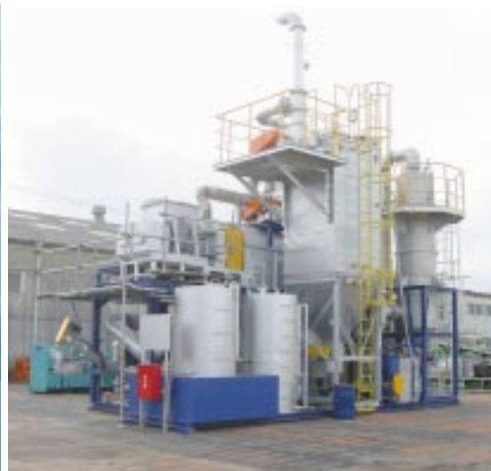
On-site dioxins decomposition system