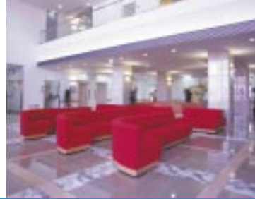
Shirone-Ohdori Hospital, Niigata

During the term under review, Penta-Ocean completed design and construction work on several physical distribution centers, including the Aeon Kanto RDC and Fukuyama Transport Kanto Distribution Center for the Fukuyama Transport Co., Ltd. Kamigumi Idetamachi Vegetable and Fruit Center in Kanagawa Ward in Yokohama City was built for Kamigumi Co., Ltd., as was the Kamigumi Constant-Temperature Warehouse , in Niigata, were also designed and built by the Group.