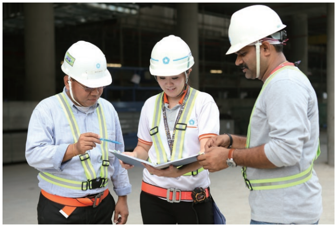
Female staff working outside Japan

In addition, we conduct training for young women in career-track position, to share career experiences and role models and to provide information on company systems and balancing childcare and work.