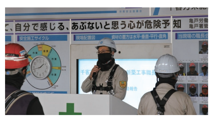
President's Patrol (July 2022)