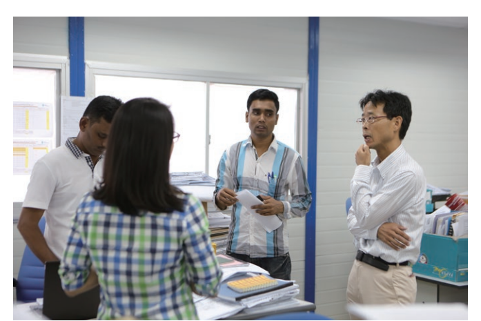
Meeting at our office in Singapore

The objective of the personnel evaluation system is to motivate employees to attain their goals, promote personnel development, and facilitate communication between superiors and subordinates. The grading and remuneration system boosts the incentive to perform well and achieve goals by reflecting performance and evaluation in the International Business Unit in remuneration, and enhances non-Japanese workers engagement in efforts to achieve their individual targets.