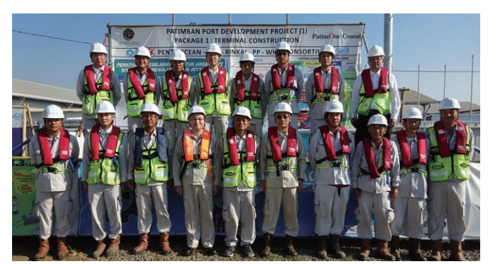
Overseas safety patrol