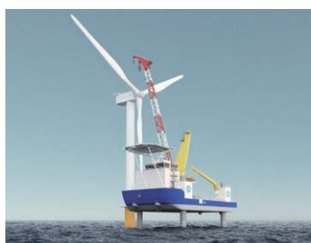
SEP-type multipurpose crane vessel (Scheduled to be completed in 2018)

Can we contribute to society? We must be aware that this question is always being asked. Infrastructure development contributing to the next generation may be an issue to be considered by the government or business operators. However, we believe that this very social contribution is implemented with consideration of "By when, how much, how to construct? How do we perform maintenance?" We want to continue to be a company which doesn't just simply construct based on drawings, but can consider how we should construct in cooperation with our customers. Therefore, we will have to continue to enhance technology required by our customers constantly.