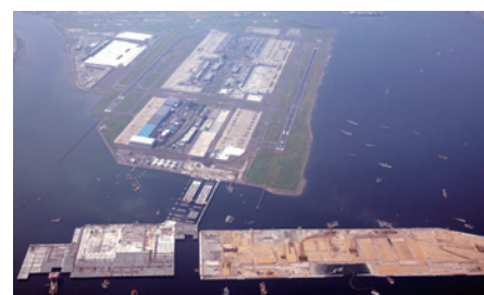
Tokyo International Airport Runway D (at the time of execution)