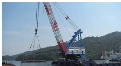
Usage example of the precast concrete construction method

We think investigating and developing technology with a viewpoint of overall optimization will greatly contribute to productivity improvement. For example, when a caisson-type breakwater with long extension is built, constructing caissons whose cross section is the same even if the safety level is somewhat excessive may be more economical than considering caissons reasonable for design wave for each water depth. Although local optimization is important, promoting overall optimization considering planning, design as well as construction is expected not only in the cost and construction period but also in quality.