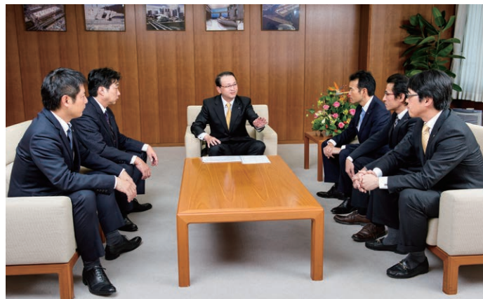
Discussion with Employees Theme: Mastering the Contracting Business

As a professional contractor, we place ourselves in our customers' or end-users' positions to provide integrated services from the planning and designing stages through construction and maintenance.