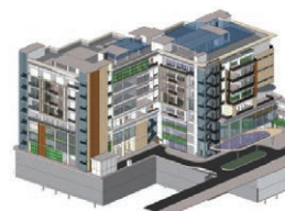
Utilization of BIM in a General Hospital in Singapore