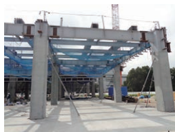
Adoption of column precast/beam steel frame structure construction method to design construction project

To achieve the work efficiency from design to construction management, as well as productivity improvement of site construction, we promote informatization construction by the introduction of ICT technology and utilization of BIM*, in which a building is displayed in 3D in the same way as CIM. We also promote work efficiency in site management and inspections such as information sharing and inspection recording by making use of ICT tablet terminals. In addition, our company has already established a lot of achievements in Singapore, where BIM is mandatory and preceding. Now, we arrange BIM utilizing technology through cooperation in Japan and overseas and promote the efficiency of site work by the early determination and accuracy improvement of construction plans or drawings, leading to improvement of construction quality and productivity.