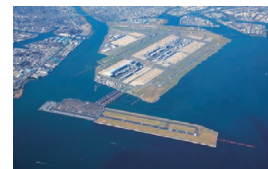
Major Japanese project-Tokyo International Airport Runway D

Won the contract to construct the Tokyo International Airport Runway D. Announced company slogan "Toward becoming the No.1 Contractor in Coastal and Waterfront Areas."