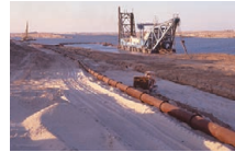
Extremely difficult Suez Canal repair work in progress

Built a cutter suction dredger, the "SUEZ," and successfully won the international tender for the Suez Canal improvement work.