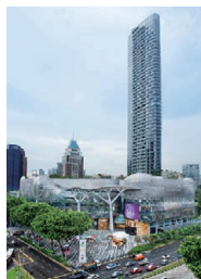
Construction work at the ION Orchard and the Orchard Residences in Singapore

Won the contract to construct the ION Orchard and the Orchard Residences in Singapore.