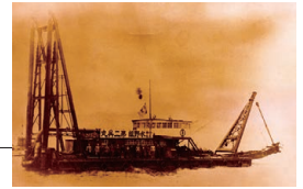
The dredger, "Kure Maru No. 2"