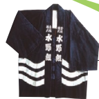
Iconic uniform of the former Mizuno-gumi