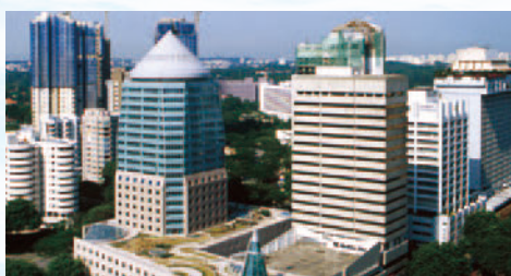
Wheelock Place (Lane Crawford Place)