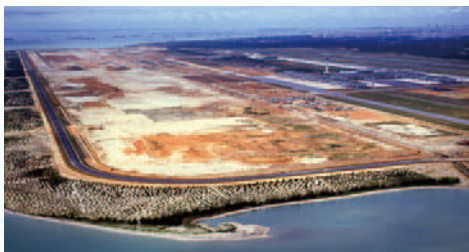
Reclamation of Changi International Airport