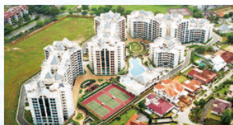
Chiltern Park Condominium