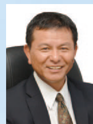
General Manager Singapore Office

Singapore in recent times has continued to grow further and develop at remarkable speed. We will also continue to improve and grow so that we can be a partner to Singapore with the nickname of "Penta-Ocean" in the next five, ten and fifty years.