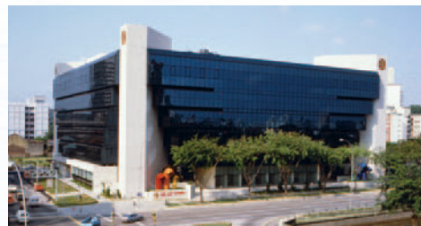
Sim Lim Square