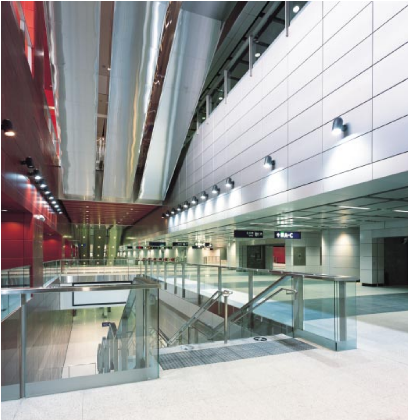
KCRC Tsuen Wan station, Hong Kong