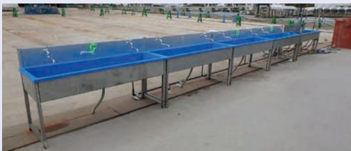
Expanding hand-washing facilities