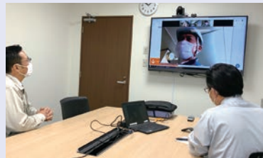
Remote safety patrol