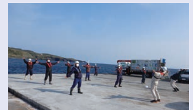
Securing social distancing during a morning assembly