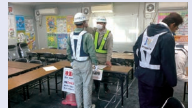
Conducting body temperature check before entry to a construction site