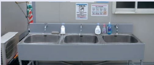
Providing disinfectant dispensers at hand-washing facilities