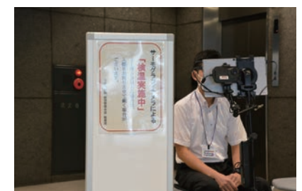
Body temperature check by thermography (Headquarters)