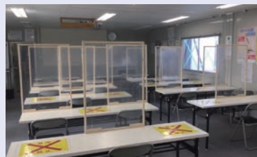
Measures to prevent the spread of droplets in a meeting room