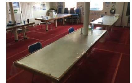
Seating arrangements avoiding face-to-face seating in the cafeterias of the vessels