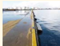
An improved wharf remains in a sound state after the Great East Japan Earthquake

This technology received several prestigious awards in the field of engineering in Japan since 2001.