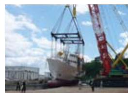
A large fishing vessel that had washed ashore is removed