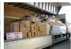
Transporting relief supplies from Penta-Ocean's branch offices to disaster areas