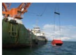
A salvage operation to remove obstacles swept into a harbor

The Penta-Ocean Group will continue to devote its full efforts toward restoration and recovery of affected areas of which we may realize a complete fulfillment being a member of the construction industry.