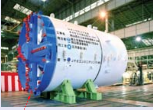
Replaceable cutter bits