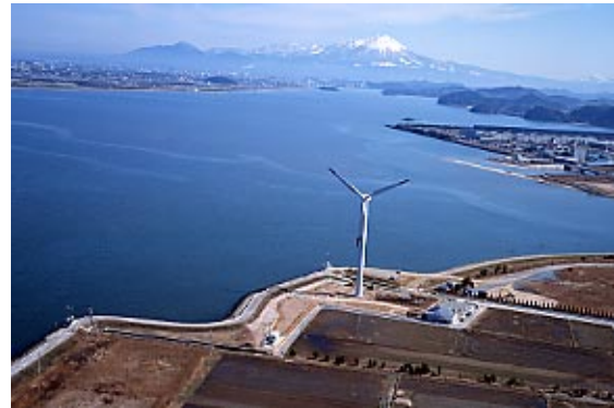
Yasugi wind power station, Shimane

In April 2000, Penta-Ocean participated in the International Environment Exposition, held at Tokyo's Bigsite Convention Center. Each year the exposition is held to introduce new waste disposal and recycling technologies and spotlight the most innovative environ-