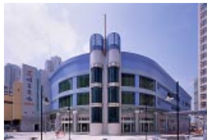
Tin Shui Wai community in Hong Kong

Consolidated construction orders received amounted to ¥480,699 million (US$3,880 million), or 18.1% more than in the previous term. Consolidated construction sales totaled ¥440,141 million (US$3,552 million), 5.1% down from the previous term's level. The contract backlog was ¥545,246 million (US$4,401 million), a 12.0% year-on-year increase.