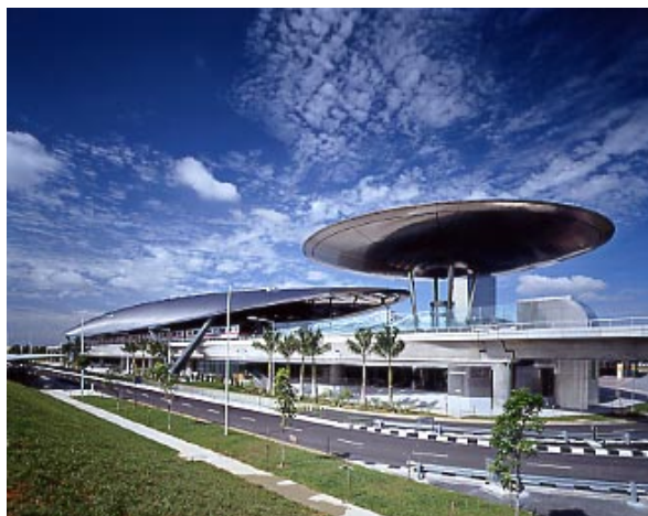
MRT502 Expo station on the Changi Airport line, Singapore

Civil engineering projects completed in Japan in fiscal 2000 included the Komagata section of the North Kanto Highway for the Japan Highway Public Corp., construction of the Wakamatsu-Yanagicho section of the Metropolitan Subway's Loop Line No. 12, and the Gamagori-Otsuka landfill for the Gamagori Ocean Development Co., Ltd.