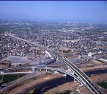
Komagata interchange on the North Kanto Highway, Gunma

Penta-Ocean received orders for additional Kiosks and other facilities at Lok Ma Chau Boundary Crossing, from the Hong Kong government. We also received orders for repair work on the Colombo Port North Pier from the Sri Lankan Port Authority, and on the Takatik fishing port facility from the Government of Micronesia.