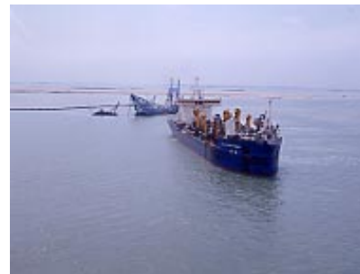
Queen of Penta-Ocean engaged in dredging work in Singapore

Fiscal 2000 saw an end to the economic slump that had gripped many Asian countries in recent years, and a return to robust economic growth, particularly in the Southeast Asian region. Investment in construction projects by both the public and private sectors continued to grow steadily. During the term, Penta-Ocean won yet another bid to continue massive reclamation and construction work for Singapore's Jurong Town Corporation. The ¥220 billion (US$1,775 million) project, includes the Jurong Island Phase IV and Tuas View Extension projects. The landfill area amounts to 1,464 hectares, or