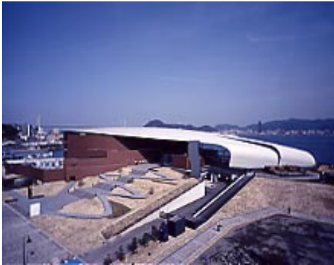
Shimonoseki Aquarium Kaikyo-kan, Yamaguchi

New orders received during the term included repair work on the Naka Plant in Hiroshima City, construction of the Urban View Grand Tower from the Hiroshima City Urban Corporation, mentioned above, and construction of the Shonandai Condominiums for Ito-Chu Urban Redevelopment Co., Ltd., and others.