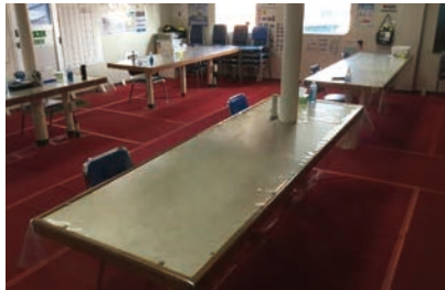
Seating arrangements avoiding face-to-face seating in the cafeterias of the vessels