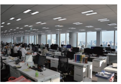
Seating arrangements avoiding face-to-face seating (classroom style) Body temperature check by thermography (Headquarters)