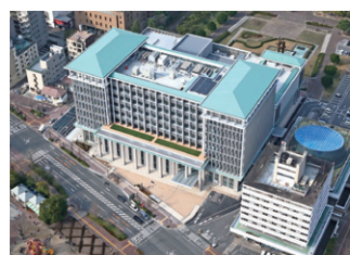
Completion of Kure City Hall (2015)