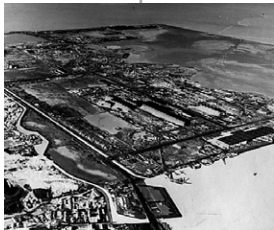
Contract awarded for construction of coastal industrial zone for Nippon Kokan Kabushiki Kaisha (currently JFE Engineering) in Fukuyama Prefecture (1961)

Stock listed on the Second Section of the Tokyo Stock Exchange (1962)