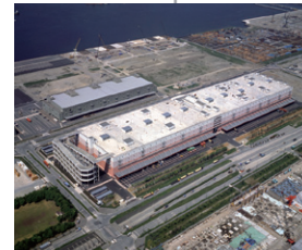
Completion of the World Cargo Distribution Center (1993)