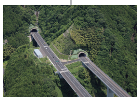
Completion of Kogouchi Tunnel of New Tomei Expressway (2005)