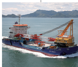
Completion of a large-scale self-propelled multi-purpose working vessel, "CP-5001" (2012)