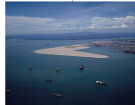
Contract awarded for reclamation work on Jurong Island, Tuas View Extension (1984)