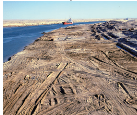
Contract awarded for Suez Canal reconstruction (1961)