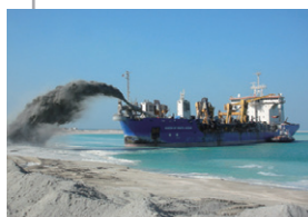
Self-propelling trailing suction hopper dredger, "QUEEN OF PENTA-OCEAN", (currently ANDROMEDA V) put into commission in Singapore (1999)