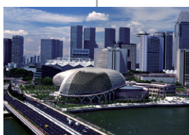
Completion of Esplanade-Theatres on the Bay in Singapore (2002)