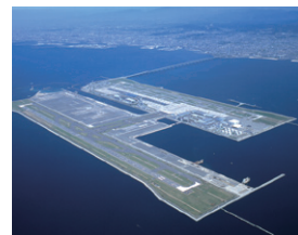
Contract awarded for phase I of construction of an artificial island for Kansai International Airport (1986)