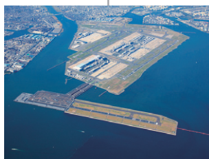
Opening of D-Runway of Tokyo International Airport (2010)