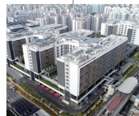
Completion of Sengkang Integrated Hospital in Singapore (2018)