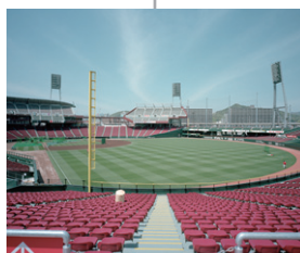
Completion of MAZDA Zoom-Zoom Stadium Hiroshima (2009)