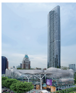
Completion of ION Orchard, and the Orchard Residence in Singapore (2010)