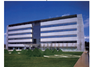
Completion of New Institute of Technology in Nasushiobara City, Tochigi Prefecture (1994)