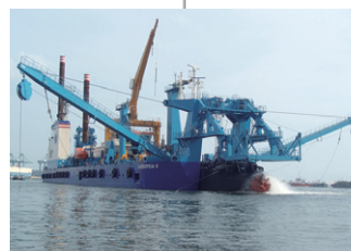
Completion of a self-propelled cutter suction dredger, "CASSIOPEIA V" (2014)