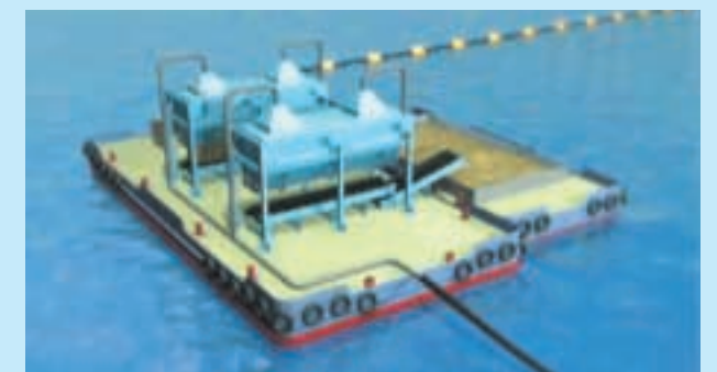
Example implemented on a ship

This system classifies and collects the recyclable sand from soft dredging soil. This reduces the amount of wasted soil during dredge projects, thereby reducing the capacity volume and increasing the usage life of reclamation processing facilities. This system is based on two new construction methods: the pipe method, which classifies the dredging soil; and the clay filter method, which processes fine particles from dirty water that has been processed by the pipe method. The pipe method separates the sand and fine particles by pressurizing the soil through the pipes, and collects only the sand. The clay filter method uses a special filtering material system with a filtering effect to filter and collect fine particles and to remove and directly discharge processed water.